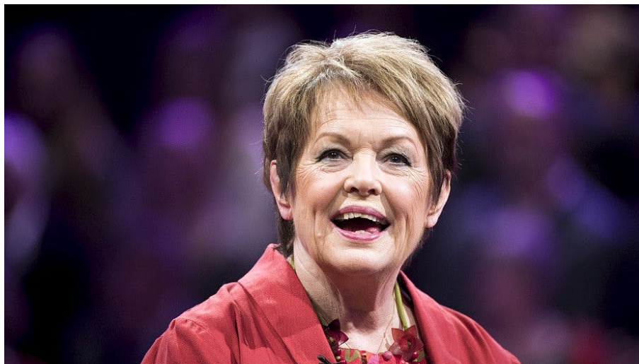
Ghita Nørby, 84, is the most beloved Danish actress today

Ghita is from the “Golden Age” of Danish film, and has played together with the best and most beloved actors ever in Denmark, for example here with Dirch Passer and Ove Sprogø, two of the very greatest. https://youtu.be/G1wWPxWqSBo?t=1m26s